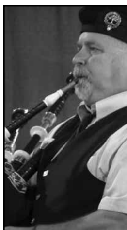
Twin Cities Metro Pipe Band Member